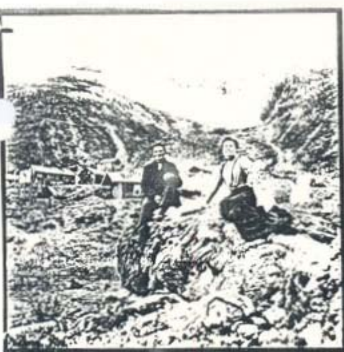
Sitting on rock near slide in Dawson--June 29, 1900