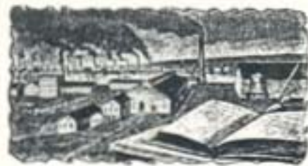
TABLE OF WAGES BY THE WEEK.