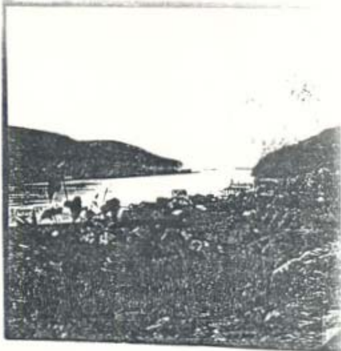
Taken at midnight June 21, 1900 Looking down Yukon river