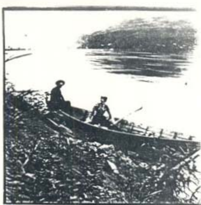
In boat on Yukon River June 29, 1900 At Dawson