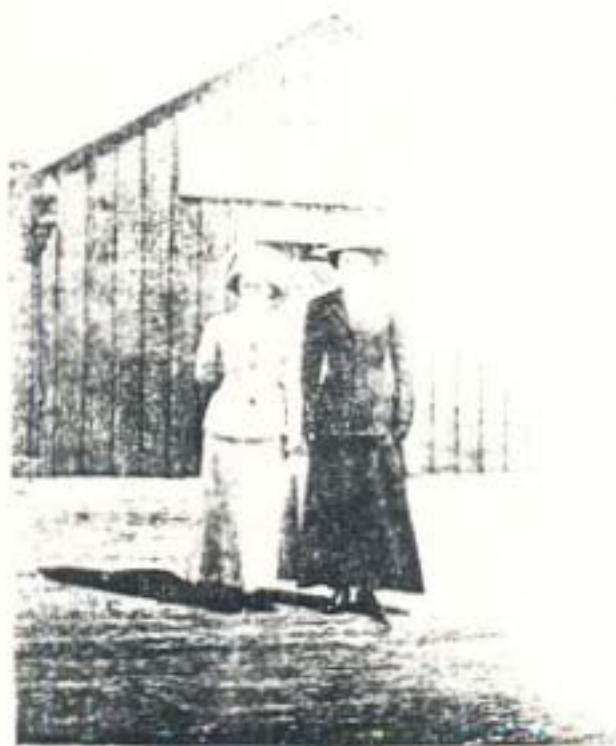
Postcard Stock No Identification